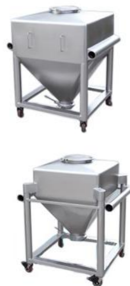
LDT Pharma Bin