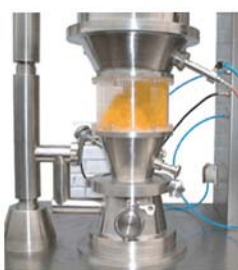
Easy Observation (Top Spray)