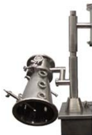
Unique Discharge Device