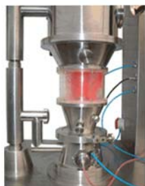
Easy Observation (Bottom Spray)